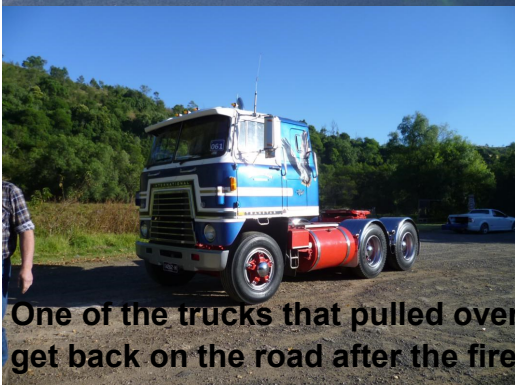
One of the trucks that pulled over to help us get back on the road after the fire