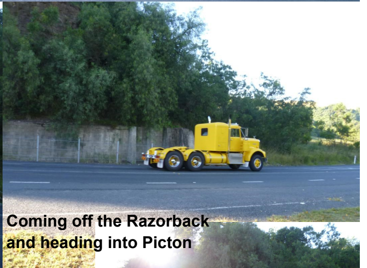
Coming off the Razorback and heading into Picton